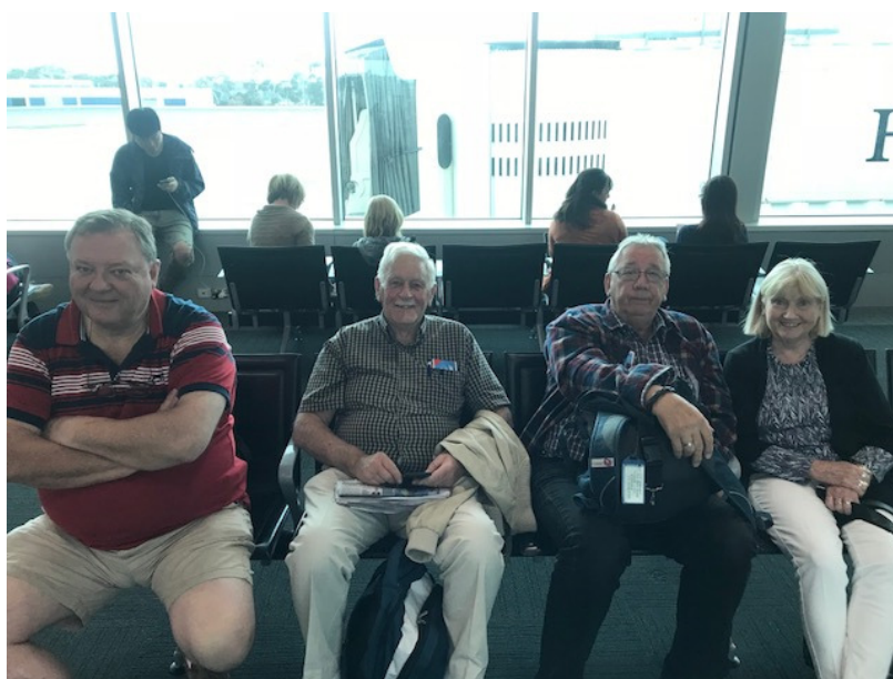
Okay I may be in trouble for sharing this one. The Victorian members